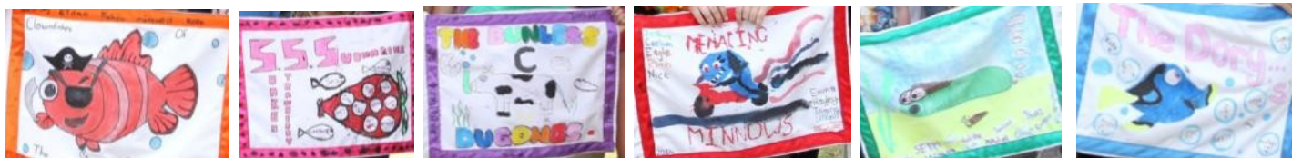
...great ideas + great design + great art skills = 6 very spectacular team banners