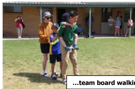
...team board walking