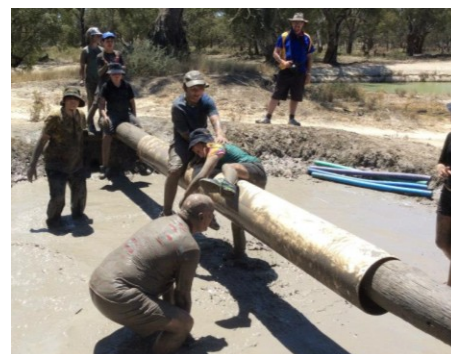
Horizontal Pole, 1 out of 15 activities @ Mallee Rovers Mud Camp