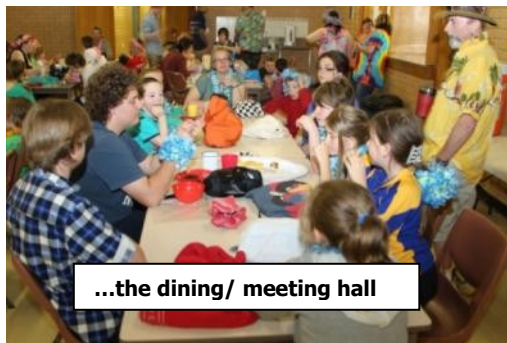
...the dining/ meeting hall