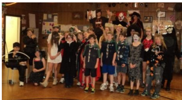
Halloween night @ scouts