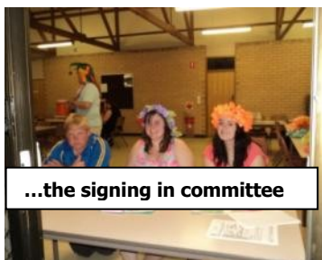
...the signing in committee