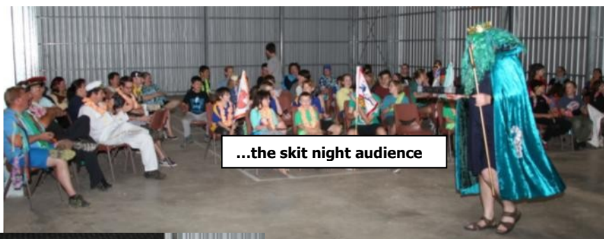
...the skit night audience