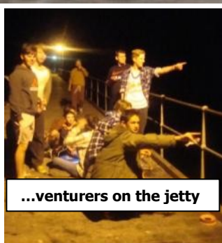
...venturers on the jetty