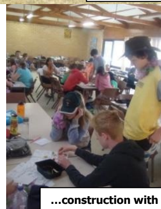
...construction with a twist