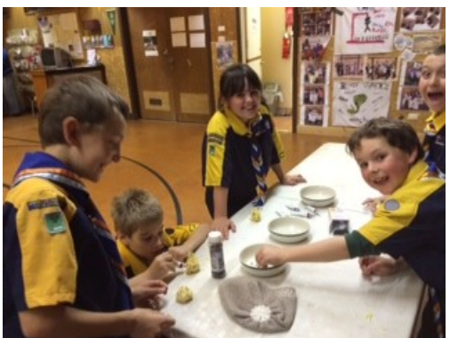
warm & fuzzy things at warm and fuzzy night