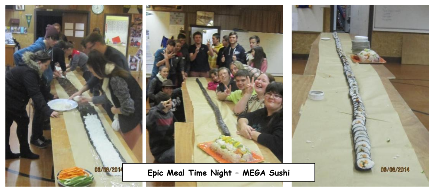
After a very successful Epic Burger in 2013 venturers had Sushi on their epic list this term. And long it certainly was. With a total length of 3.5m it is probably the longest Sushi roll in Northridge scouting history. Well cooked & Yum!